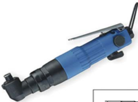
OP-301L90 F Rear exhaust 後排氣